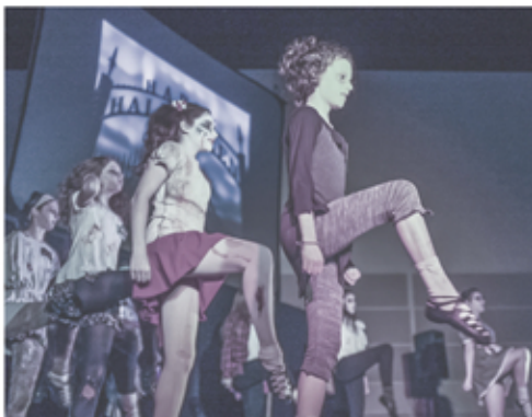
Dancing Irish zombies perform for the audience at the How-To Halloween event at the Lansing Center Saturday.